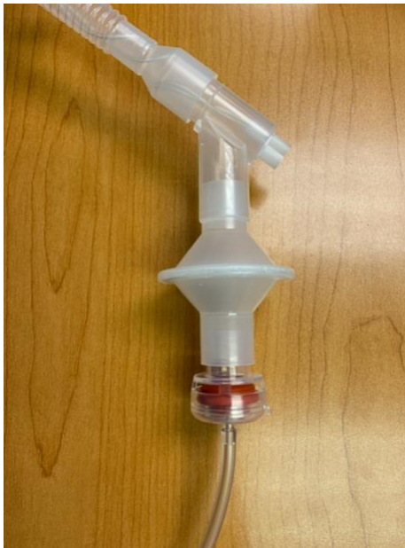
Bacterio-viral filtration for mushroom-valve exhalation (e.g. LTV, MRI vent)