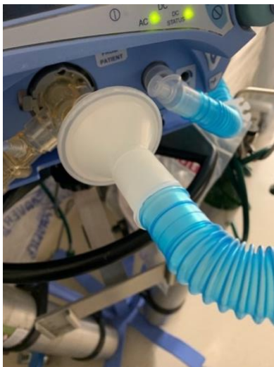
Transport Ventilator (Vela) with bacterio-viral filter at exhalation port