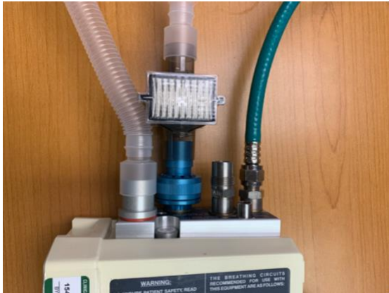
Transport Ventilator (babyPAC) with bacterio-viral filter at exhalation port