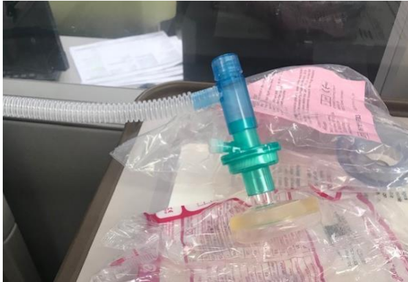
Manual Resuscitation with bacterio-viral filter for transport (or any other bagging needs)